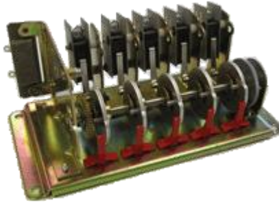
MC Series Timer

There is no operator involvement in the operation of this device. When power is applied to the motor, it drives the cams that in turn drive the load switches to follow the preset program.